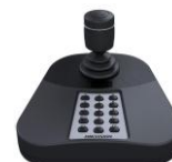
DS-1005KI USB Joy-stick