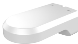
DS-1294ZJ Wall Mount